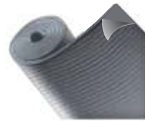
IC CLAD COVER