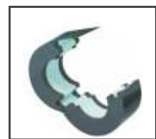
K-FLEX PIPE SUPPORT