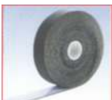
JOINT SEALING TAPE